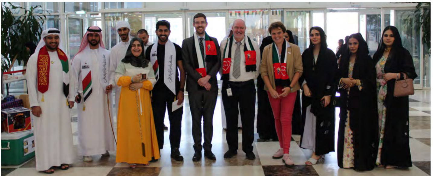
ADPoly staff and students enjoying the festivities for National Day