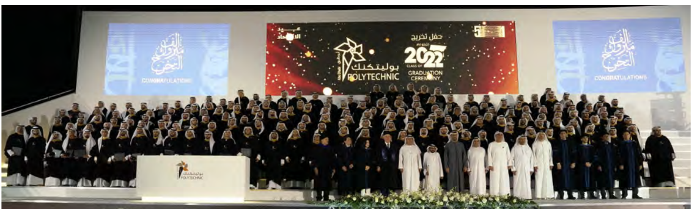
Male graduate group photo