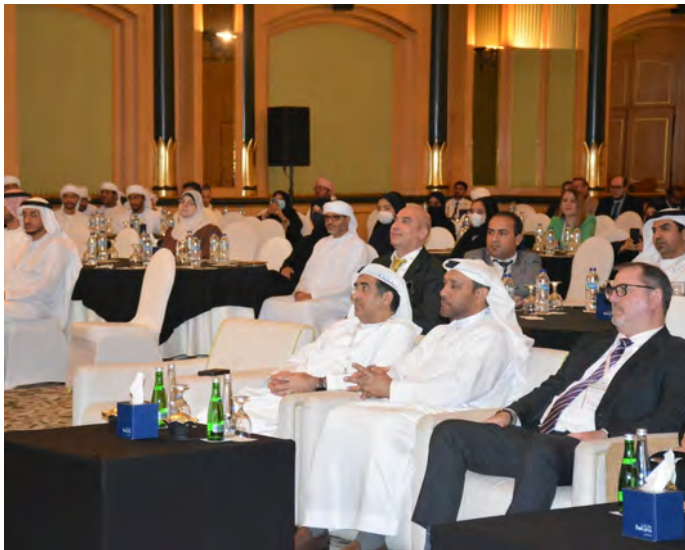
IAT Management and ADPoly Staff in attendance

The forum began with the national anthem and then praised the role of the UAE's wise leadership in recovering from the effects of the Covid-19 pandemic. There was a particular emphasis on their generous support for the aviation sector as well as vocational and technical education.