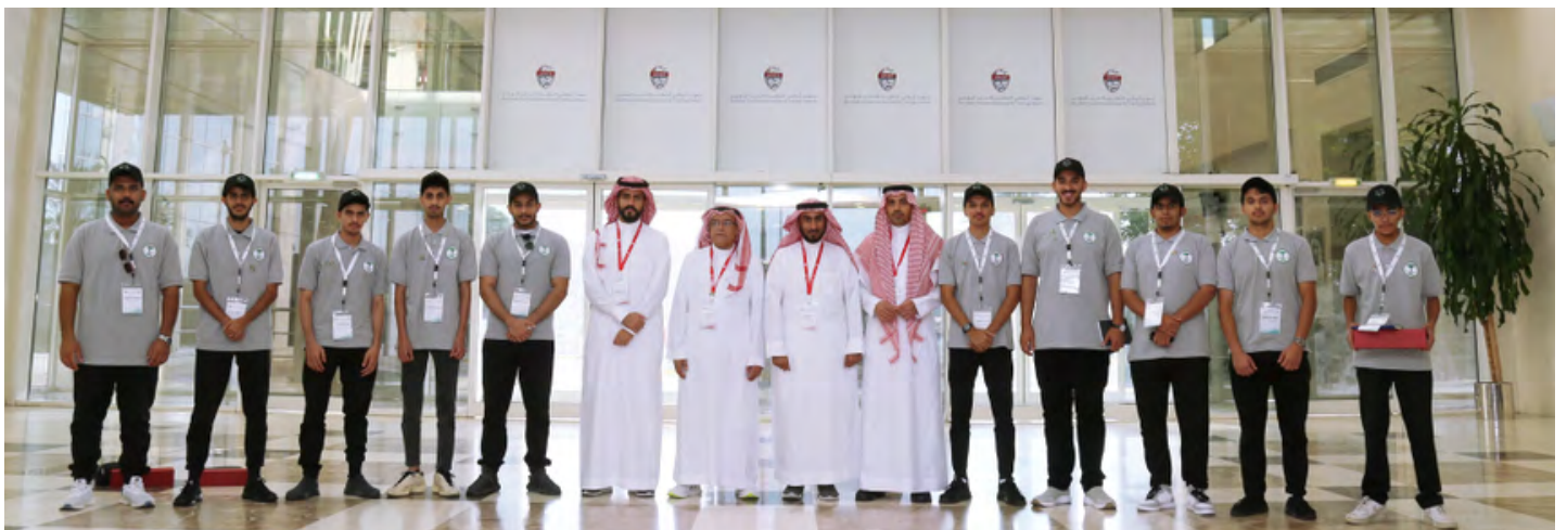
KSA delegation with ATHS students at the ADPoly campus, Abu Dhabi