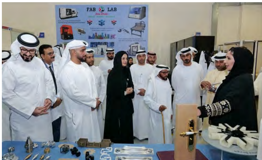
Visitors watching a demonstration in the FabLab

The attendees had the chance to visit both the Innovation Majlis and the Fab Lab, and to observe students and faculty demonstrating the hardware, software and materials in both places.