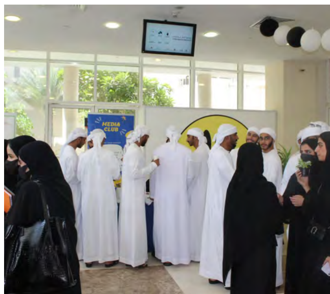
Students having fun at the club fair