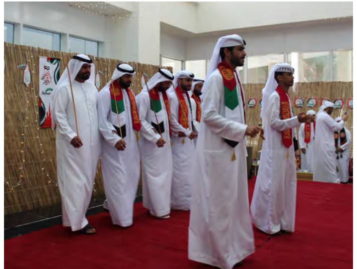
UAE band dancing the yowlah

At the end of the celebration, cultural stage performances, including a song performance and traditional Al-Yola dance was performed by the music club.