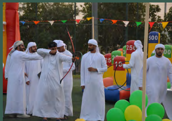
Students enjoying the event