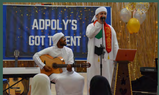
Students from the music club performing