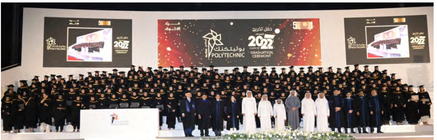
Female graduate group photo