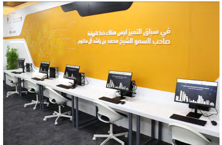
Photos showing the state-of-the-art facilities at Abu Dhabi Polytechnic