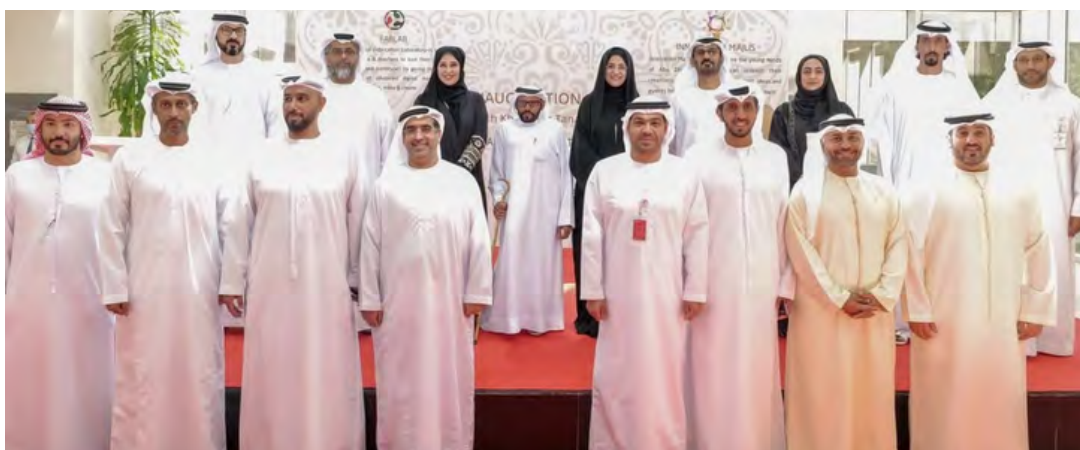
Visitors at the Inauguration Day posing for a group photo