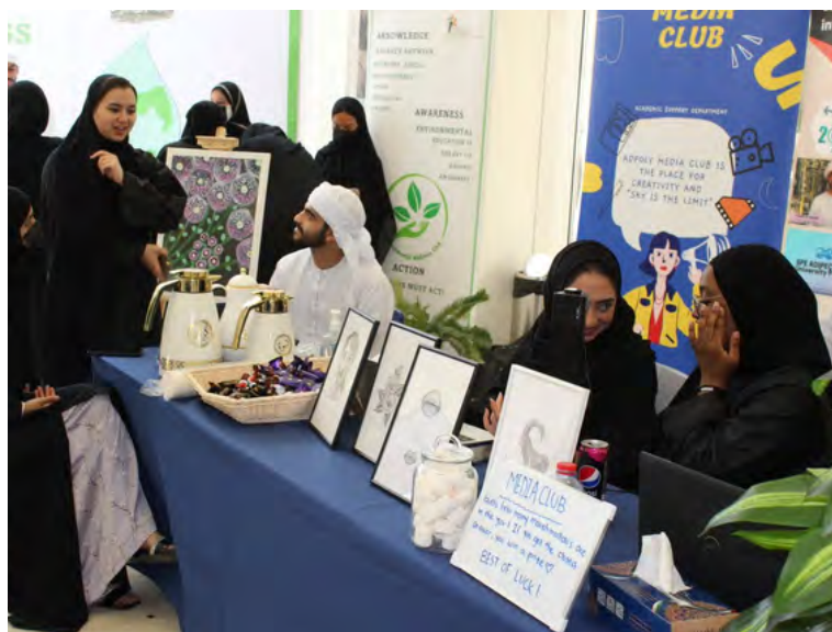
Students representing the media club