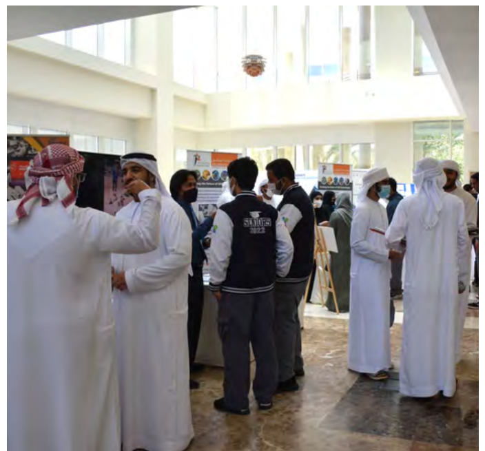
Current and potential ADPoly students enjoying the day