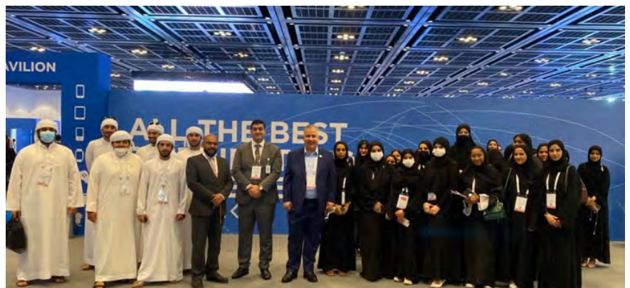
ISET Department Faculty Members and students at GITEX Global

Students were able to explore the technology field and were also invited to attend the Memorandum of Understanding signing between Abu Dhabi Polytechnic and Cisco International Limited. It was an honour for our students to take part in such a revolutionary event. Technological minds gathered in Dubai, the starting point of the future.