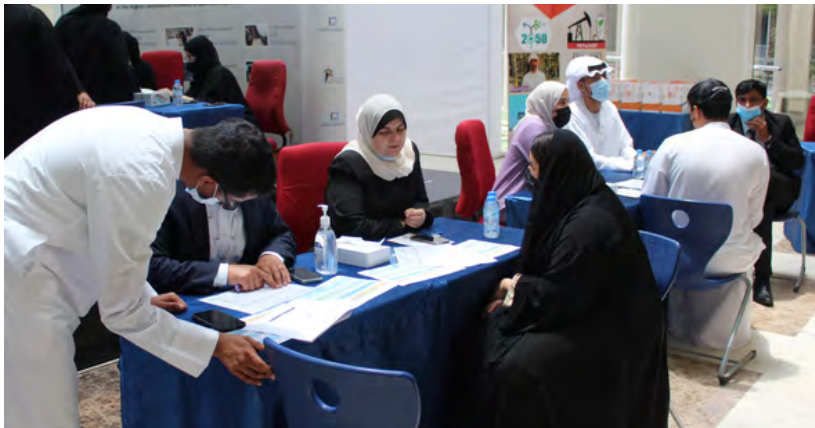
New students discussing programs with EMET staff members