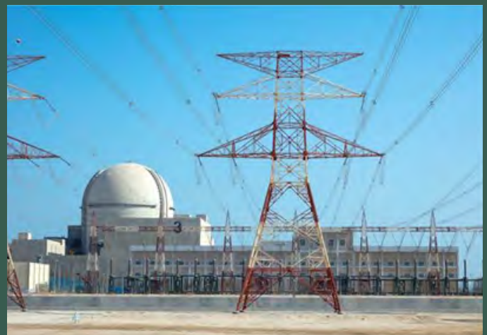
Unit 3 of the Barakah Nuclear Energy Plant

This expansion comes as good news for ADPoly, who regularly send nuclear graduates to work at Nawah.