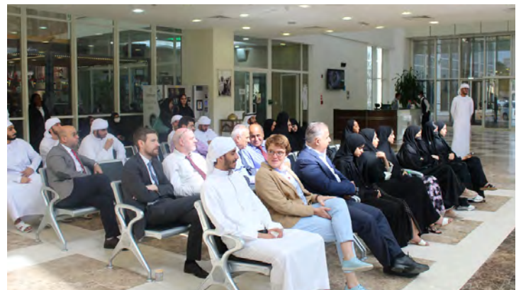
Members of the audience enjoying the talk

All ADPoly students can sign up following the link generated by this QR code