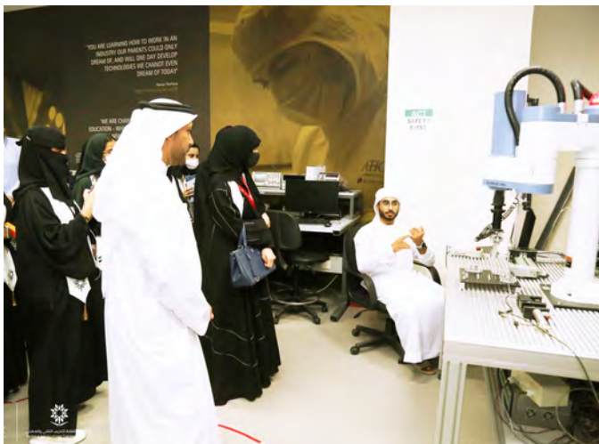
ADPoly students demonstrating 3D printing to the delegation