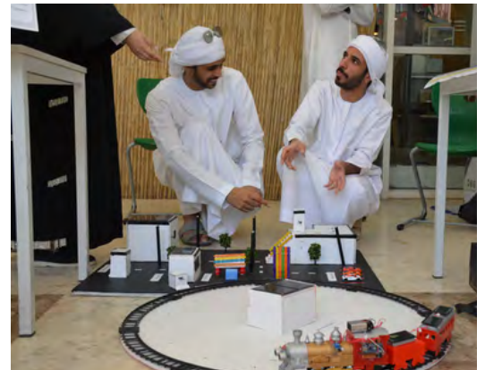
Students proudly displaying their projects