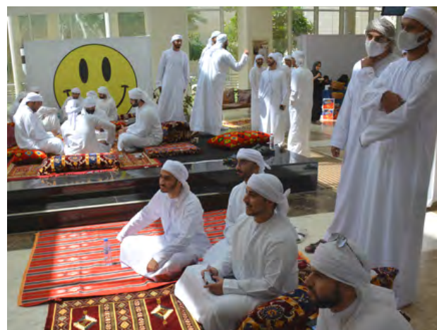
Students enjoying video and board games