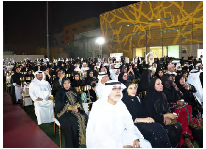
Families proudly watching the ceremony

During the graduation ceremony, a short film was screened highlighting the development of ADPoly's journey. At the end of the ceremony, the graduates were awarded their graduation certificate and took a group photo to mark the closing of the event.