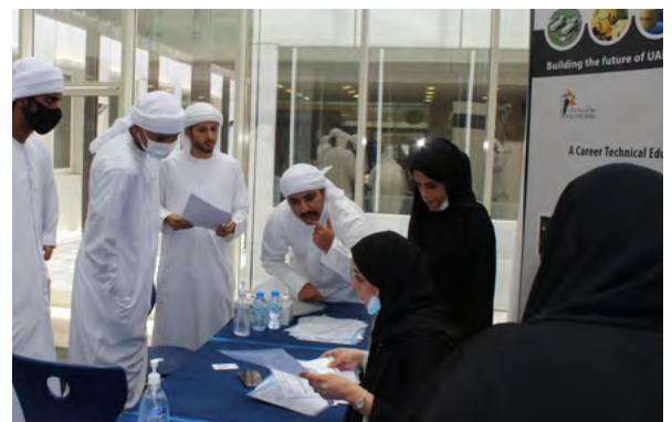
New students visiting the nuclear technology stand