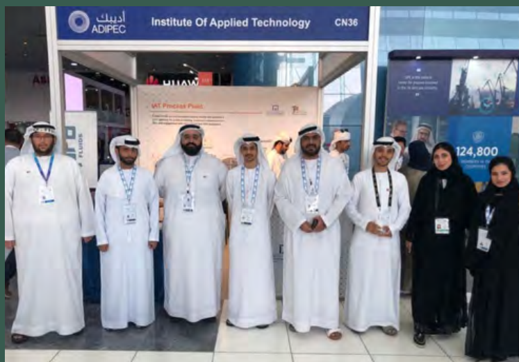
ADPoly students at the IAT stand

During the Process Plant Exhibition at ADIPEC, more than 150 companies visited the IAT booth and potential industry partners have exchanged information, expressed intentions for collaboration and engaged the ADPoly PET/CHET presenters, trainers and SPE students in technical discussions. For four straight days, IAT Process Plant facility has gained prominence and received positive feedback among the international community of technocrats, investors, engineers and professionals in the chemical, oil, gas and energy sectors.