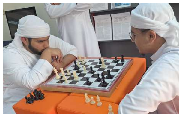
Players mulling over a double-edged position