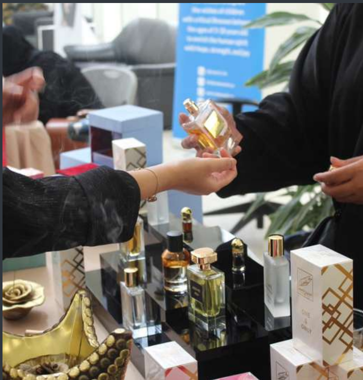
One of the stalls selling perfume at the event

The day was filled with a variety of student businesses, each showcasing their unique products and services. From handmade crafts to tasty food items, the range of products on offer was impressive. Additionally, the event featured entrepreneurship talks by successful business leaders who shared their experiences and insights with the budding entrepreneurs.