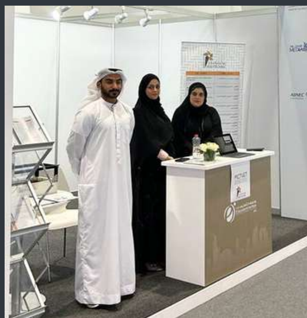
ADPoly's stand at the exhibition