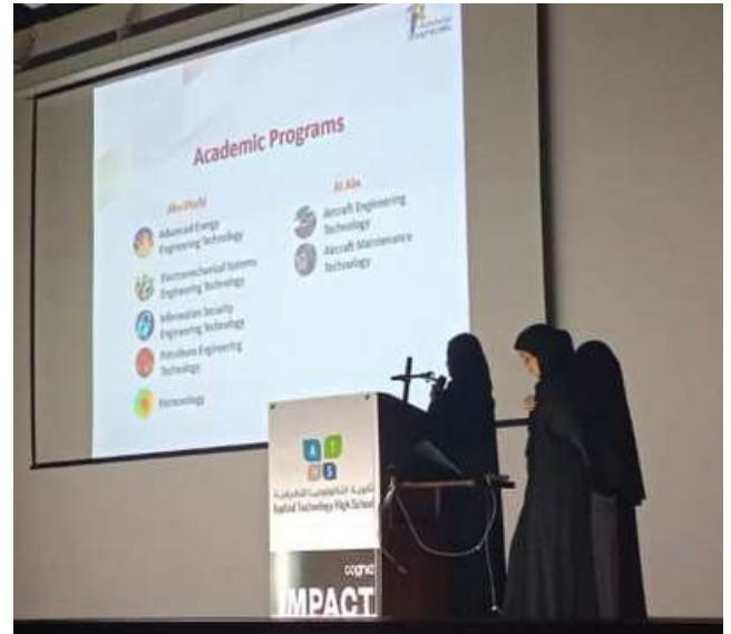
Student services delivering the presentation

As part of the induction process for new students at ADPoly, the Student Services Department delivered an orientation day to welcome new joiners to our college and provide them with all the essential information they need to know about academic life at ADPoly.