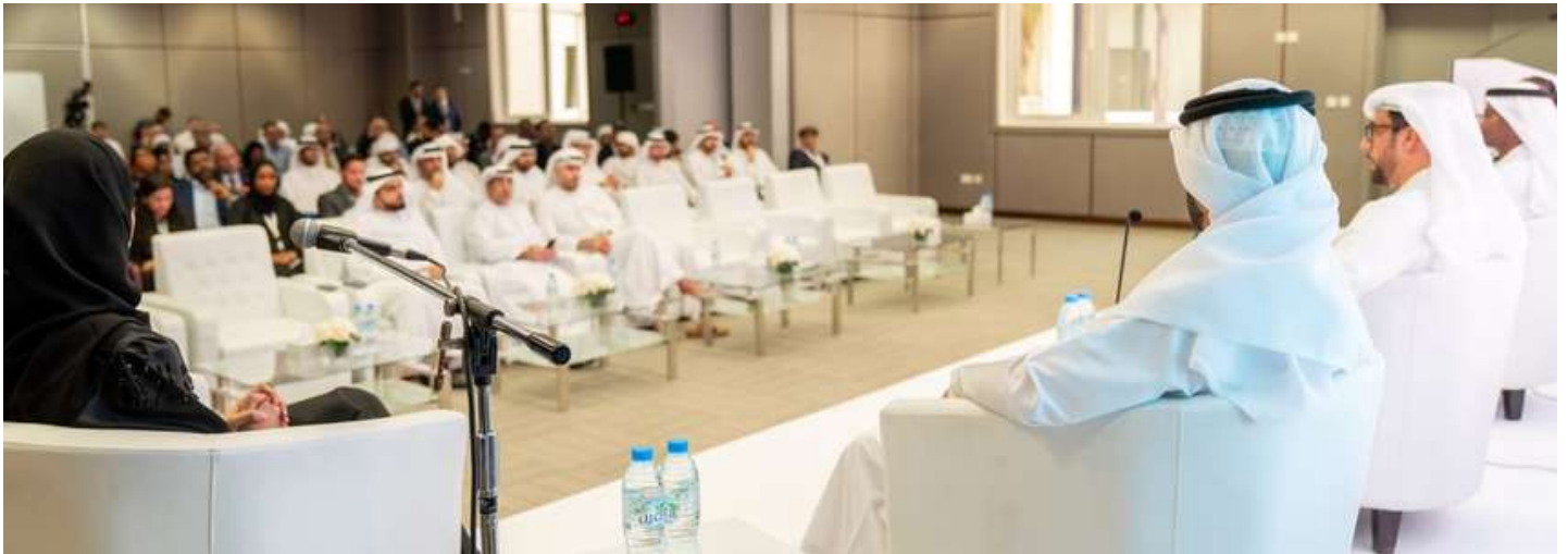
Students, faculty members and other visitors attending the panel discussion