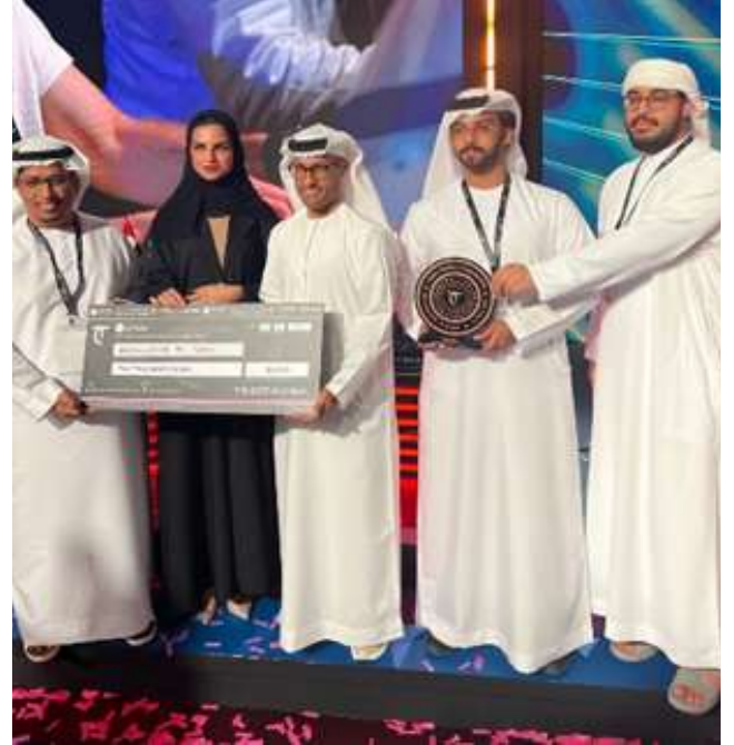
ISET students proudly collecting their awards

We are delighted to announce the exceptional achievements of Abu Dhabi Polytechnic students at the Intersec Cyber Drills 2023, held at the Dubai World Trade Centre from January 17 to 19, 2023. The event featured a captivating Capture the Flag (CTF) competition, providing a platform for students to showcase their cybersecurity expertise.