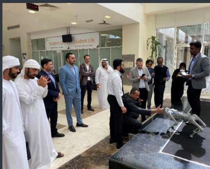
Students and EMET staff checking out the demonstration