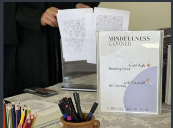
The library's mindfulness corner

The university library recently set up a mindfulness corner in line with the month of reading. The corner was designed to provide students with a peaceful space to unwind, relax, and engage in activities such as reading, colouring, and artwork. The corner featured a reading nook and an art therapy area, both of which were well-received by students. These activities not only provided a creative outlet for students but also promoted mindfulness and helped reduce stress levels. The mindfulness corner was a successful initiative that helped create a more holistic learning environment and contributed to the well-being of the university community.