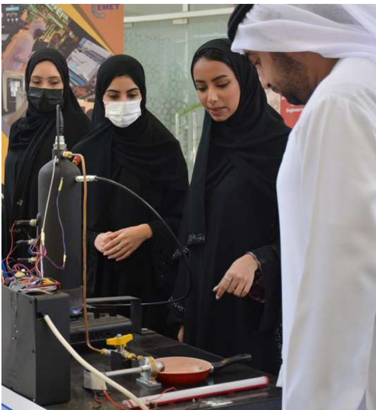
ADPoly students representing the EMET Department at the Open Day