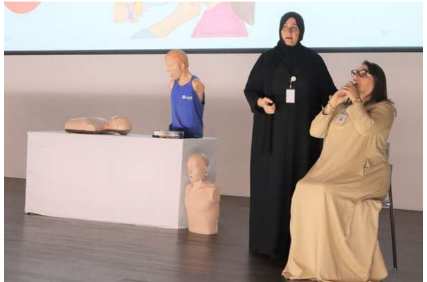
Fatima college staff delivering the first aid training

Abu Dhabi Polytechnic and Fatima College of Health Sciences collaborated to organise a first aid training workshop. Led by qualified staff, the workshop aimed to promote swift intervention in emergencies and ensure individual safety. Participants gained essential life-saving skills, covering topics like head injuries, fractures, wounds, and more. Practical exercises enhanced learning, allowing application of knowledge in realistic scenarios. The workshop stressed following correct procedures, prioritizing breathing and blood circulation, and taking prompt action. The program empowered individuals to respond effectively in critical moments, contributing to community well-being and safety.