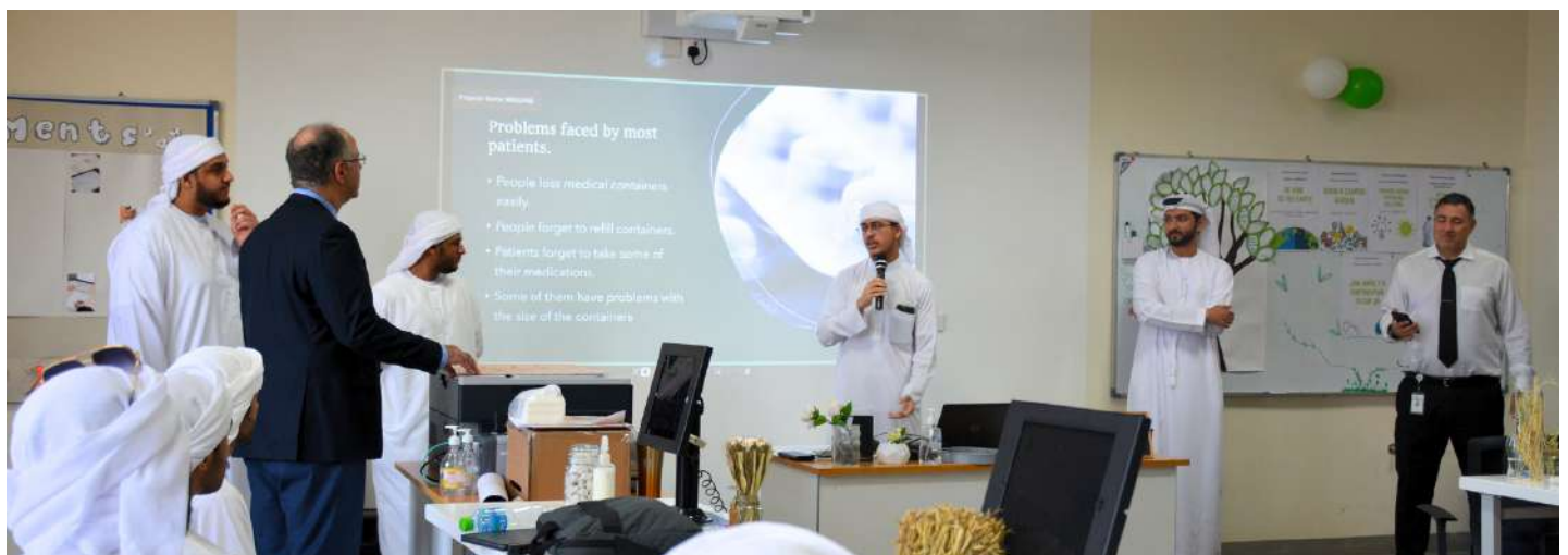
Students from the Innovation Club delivering their presentations