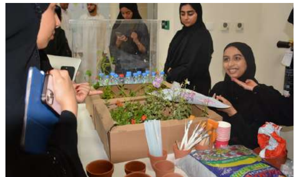
Students displaying the plants they cultivated