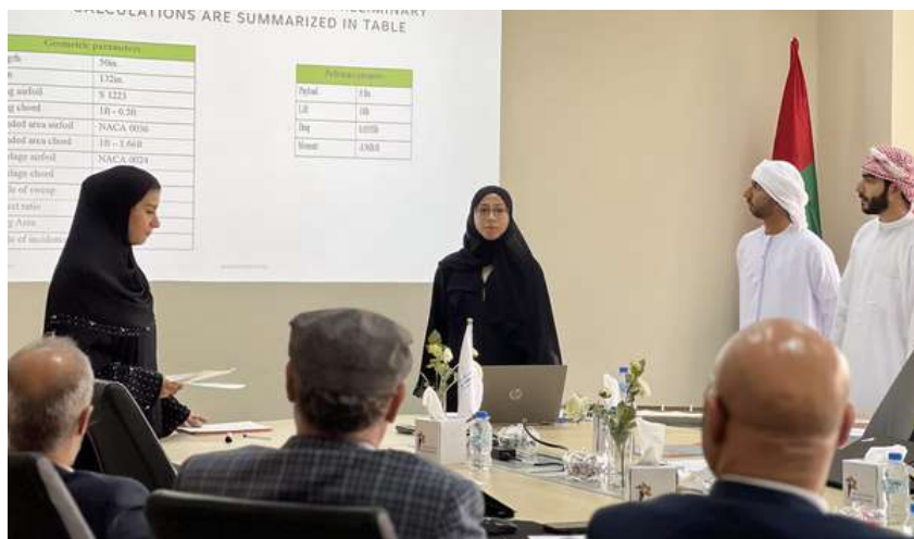
Al Ain aviation students presenting their graduation project