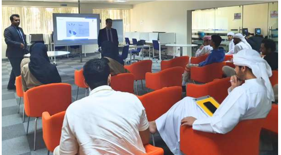
ADPoly students taking part in the innovation seminar