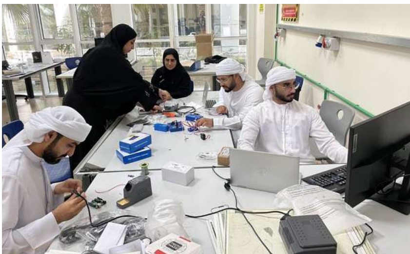
Abu Dhabi EMET students working on their bionic hand project