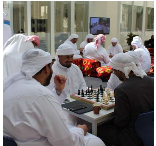
Students enjoying the day's festivities

Abu Dhabi Polytechnic partnered with the Make-A-Wish Foundation to host the Make a Wish event, supporting the fulfillment of wishes for children with critical illnesses. The event included the Umniaty Souq held at the Abu Dhabi campus, showcasing products made by families, including accessories, perfumes, food, and skincare items.