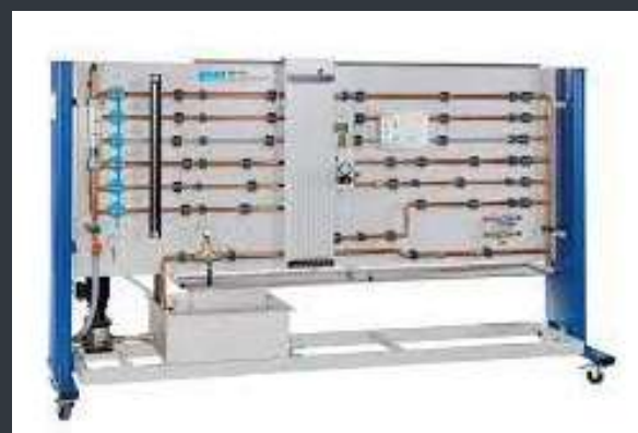
HM 250 "GUNT Fluid Line"

Participants learned about the HM 250's features, including its advanced sensors, versatile control system, and comprehensive data acquisition capabilities. The event was well-received by attendees, who expressed their appreciation for the opportunity to learn from experienced experts and acquire practical skills that will enhance their professional development.