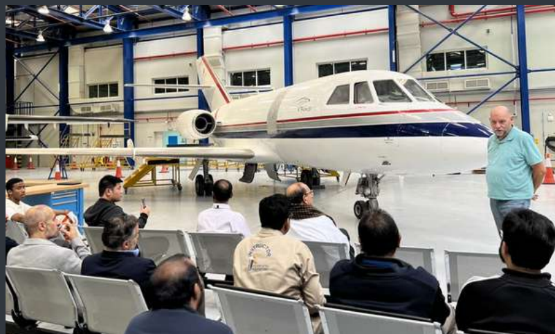
Al Ain staff attending the workshop