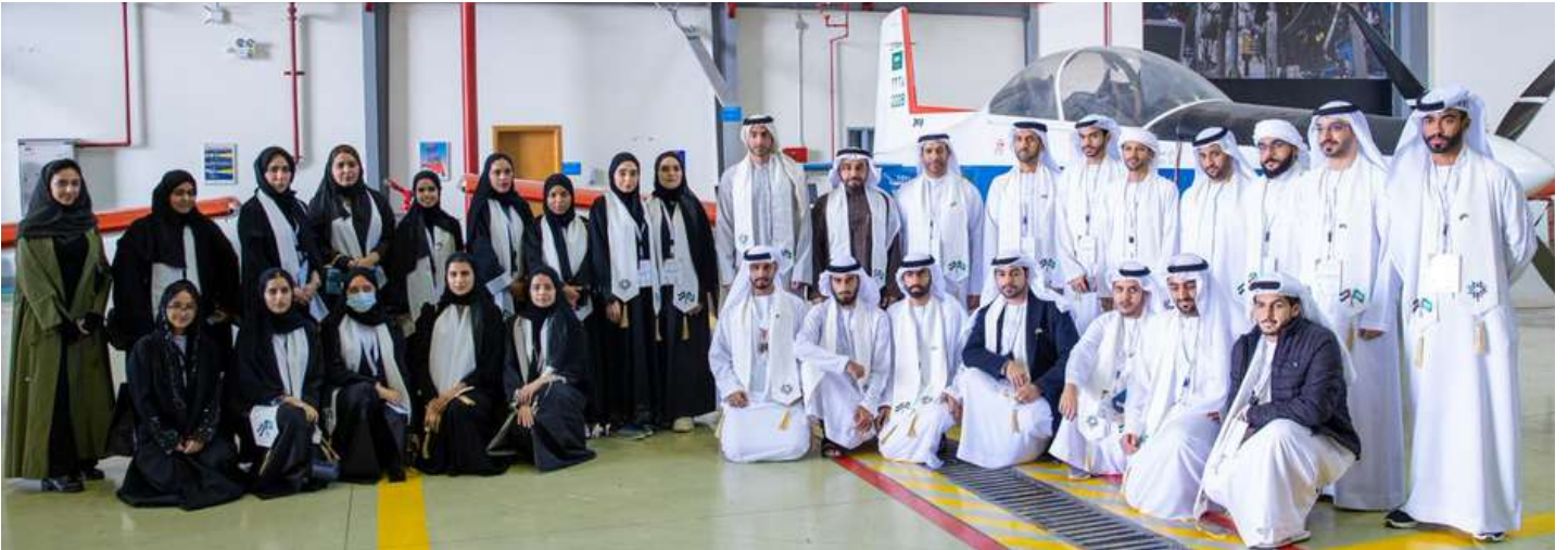
ADPoly students posing for a group photograph at the International Aviation Technical College

A total of 22 male and female students participated in the program, and the trip began with a meeting with the Saudi side to clarify the visit plan. On the second day, the students attended the inauguration ceremony of the Four Challenges Competition at the International Aviation Technical College, sponsored by the Governor. They also met with His Excellency the Governor and the Ambassador of the United Arab Emirates to the Kingdom of Saudi Arabia, Sheikh Nahyan bin Saif Al Nahyan , and went on a sightseeing tour.