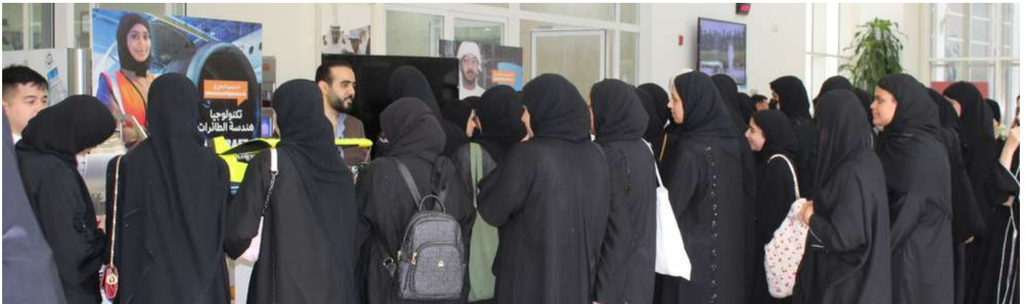
Prospective students exploring the stalls in the main foyer of Abu Dhabi campus