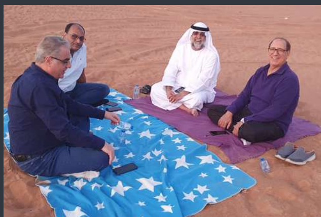
ADPoly staff enjoying the day

The gathering provided an opportunity for the staff and their families to socialize and bond in a relaxed and informal setting. Overall, the event was a success, fostering a sense of community and camaraderie among the attendees. Everyone is looking forward to similar social events in the future.