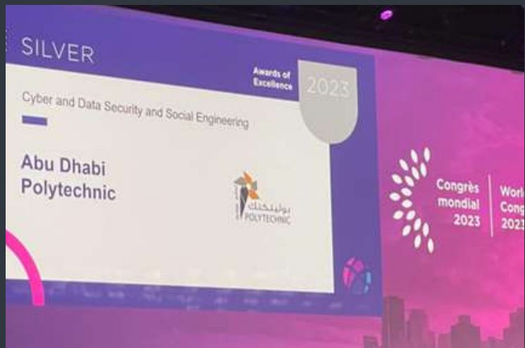
A projection of ADPoly's award on display at the event

The Awards seek to distinguish WFCP member institutions and individuals whose exceptional initiatives are strengthening applied learning and research outcomes, and celebrate remarkable contributions to skills development and the wider economic and social development.