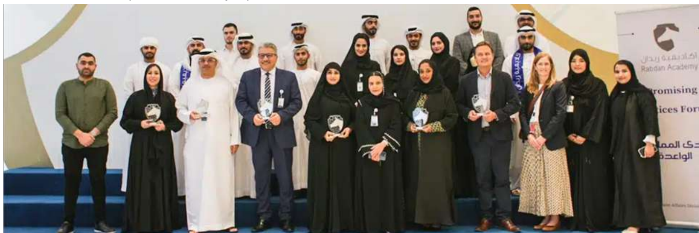
Members of ADPoly Student Services along with other participants at the Promising Practices Forum

The initiative highlighted the best international practices in enriching the student life at the national level and keeping abreast of relevant developments. The participation of the Students Service Department at ADPoly in such events is crucial to providing students with the best possible university experience.