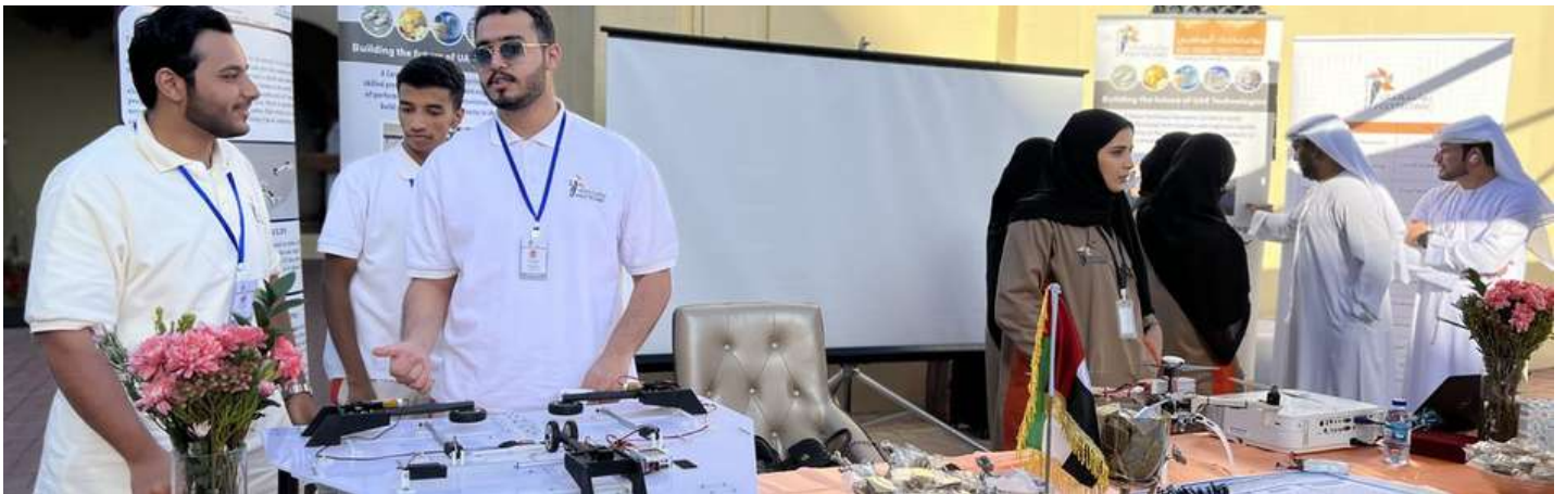
ADPoly students with their graduation projects on display at the Innovation Day

Abu Dhabi Polytechnic exhibited different projects related to its programs offered at Al Ain Campus, including innovative projects made by students in the areas of Aircraft Landing Gear system and Unmanned Aerial Vehicle (Drone). The event was attended by over 100 people and received positive feedback from attendees. It provided an excellent platform for networking and promoting Abu Dhabi Polytechnic, with its staff taking part in the event.