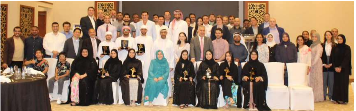
Faculty members and students posing for a group photograph at the end of the banquet