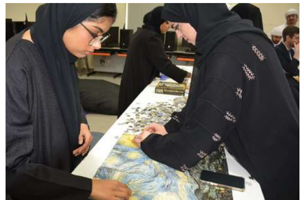
Students doing puzzles and socialising